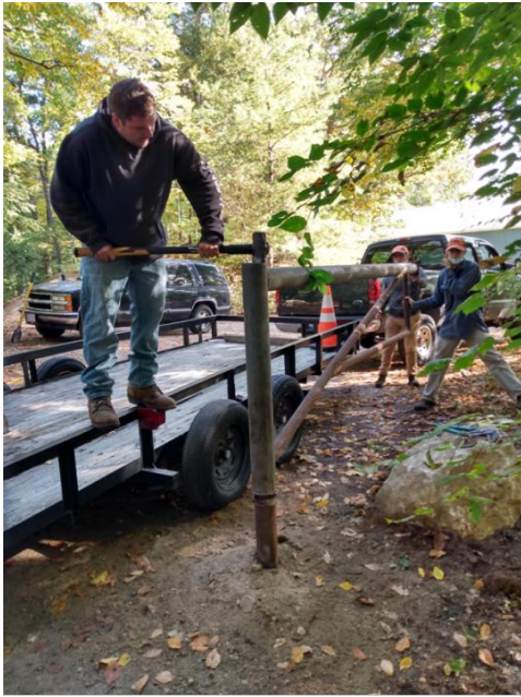
Townsend Cemetery and Parks Department installed a gate to prevent vehicle access to the riverfront at Adams Dam.