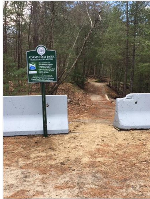
Barriers at the Jefts Street end of the trail will deter motor vehicles. The final task was to install signs that list rules and regulations for park users.