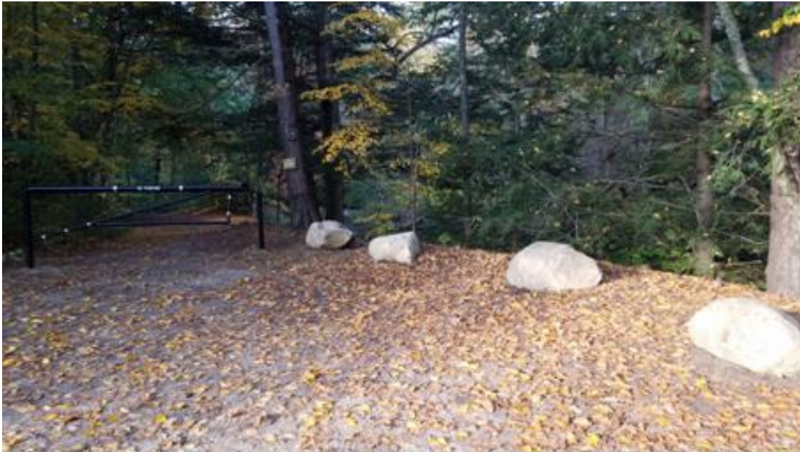
The locked gate will prevent vehicles from approaching the riverbank near Adams Dam. Large boulders along the top of the steep bank will keep vehicles away from the riverfront area.