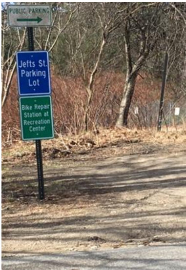
Additional signs purchased through the MA DOT Shared Streets program are currently being installed. The new signs will guide residents and visitors to outdoor destinations and places to park.

The following table is the budget submitted for this project and the amount expended (blue text). Receipts are attached at the end of this report.