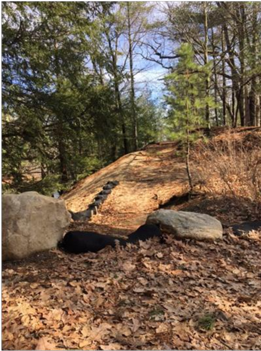
GroSoxx "living walls" along the path in the steepest areas will stabilize the soil and promote vegetative growth.