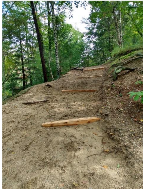
White cedar timbers were installed to stabilize the steepest section of path and prevent further erosion.